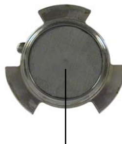
Cell Cap (#171-62)