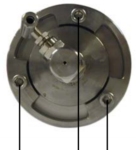
Locking Screws (#171-78)